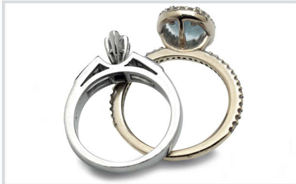
10-YEAR OLD PLATINUM RING VS. 2-YEAR OLD WHITE GOLD RING

Platinum, a naturally white metal, will never fade or change color. White gold will yellow over time, requiring its rhodium plating to be replaced every 12-18 months to maintain a white appearance. The optimal setting for diamonds is platinum, a naturally white metal that won't ever reflect color into the diamond. Platinum enhances the brilliance of diamonds and other gemstones.