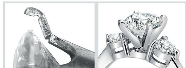
14K NICKEL WHITE GOLD

Platinum's strength and durability makes it the most secure setting for diamonds and precious gemstones. Platinum prongs offer better protection for diamonds, which is why the world's most significant diamonds, from the Hope Diamond to the 60-Carat Taylor-Burton Diamond, are all set in platinum.